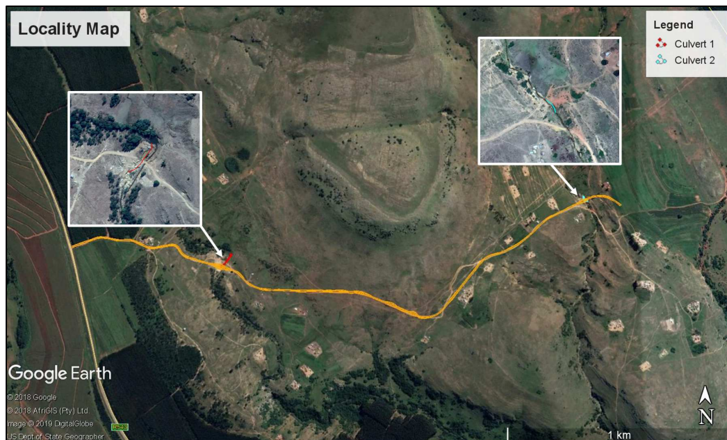
Figure 1: Google Earth image of the locality of the two culvert bridges and gravel road

The two culvert bridge crossings and gravel road upgrade are located in Mkhondo Local Municipality within Gert Sibande District Municipality in the Mpumalanga Province ( Figure 1 ). The culvert bridges form part of a main road, which will be upgraded, in Sandbank Village. The town of Piet Retief is located approximately 16km from the culvert sites ( Figure 2 ).