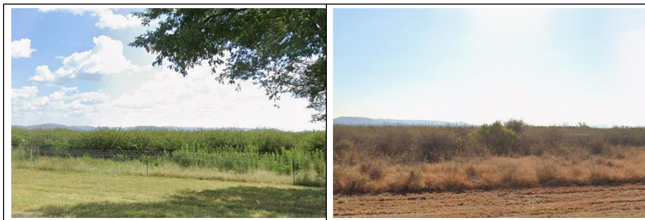
Photo 1. View from the road indicating that there is no cultivated land on the site