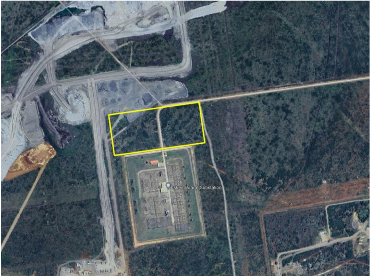
Figure 3. Google Earth Inge indicating mining activities surrounding the site