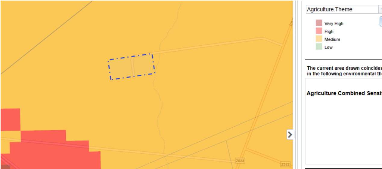
Figure 2. Site sensitivity - screening tool (red indicates very high, orange is high and yellow is medium)